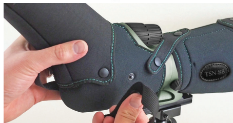
Attach strap (F) to both sides of part (B) using the press studs.