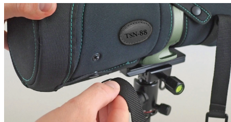
Repeat this process with the other strap (F) on to both sides of part (A).