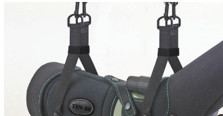
Repeat this process at the rear of the scope.

Receive the latest Kowa sporting optics news and offers first, visit www.kowasnextbigthing.com and sign up to our newsletter.