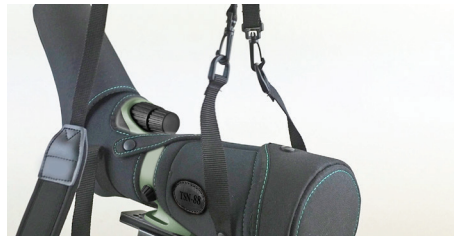
Connect main strap (G) to straps (F) with both clips on either side of the front of the scope.